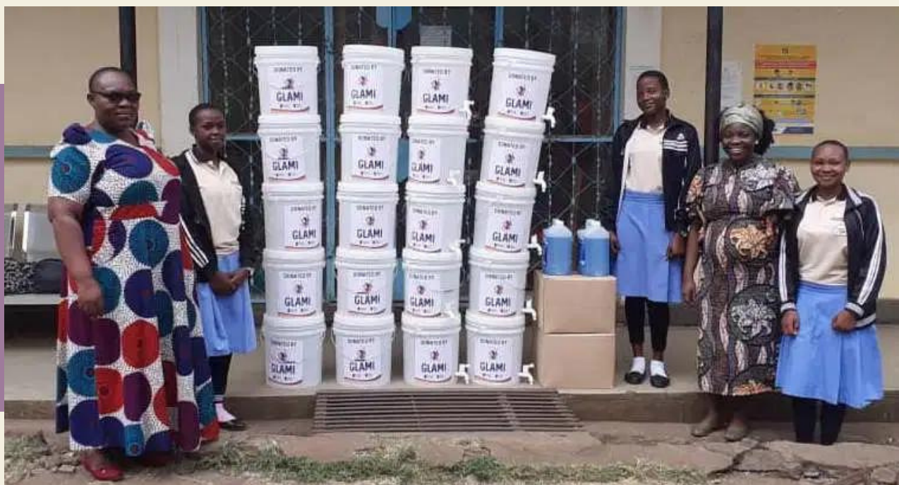
Students and staff at Mringa Secondary School with GLAMI's donated handwashing stations.

- HEAD OF SCHOOL, MAJENGO SECONDARY SCHOOL