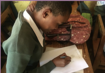
A Binti Shupavu Scholar works on an assignment from her Mentor.

In 2020, 98% of graduating Form Four Binti Scholars passed their final national exam, at a rate 8% higher than their peers.