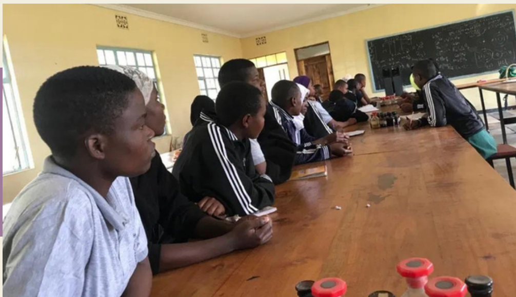
Kisa Scholars at Mringa Secondary School listen to the first session of GLAMI's radio show.